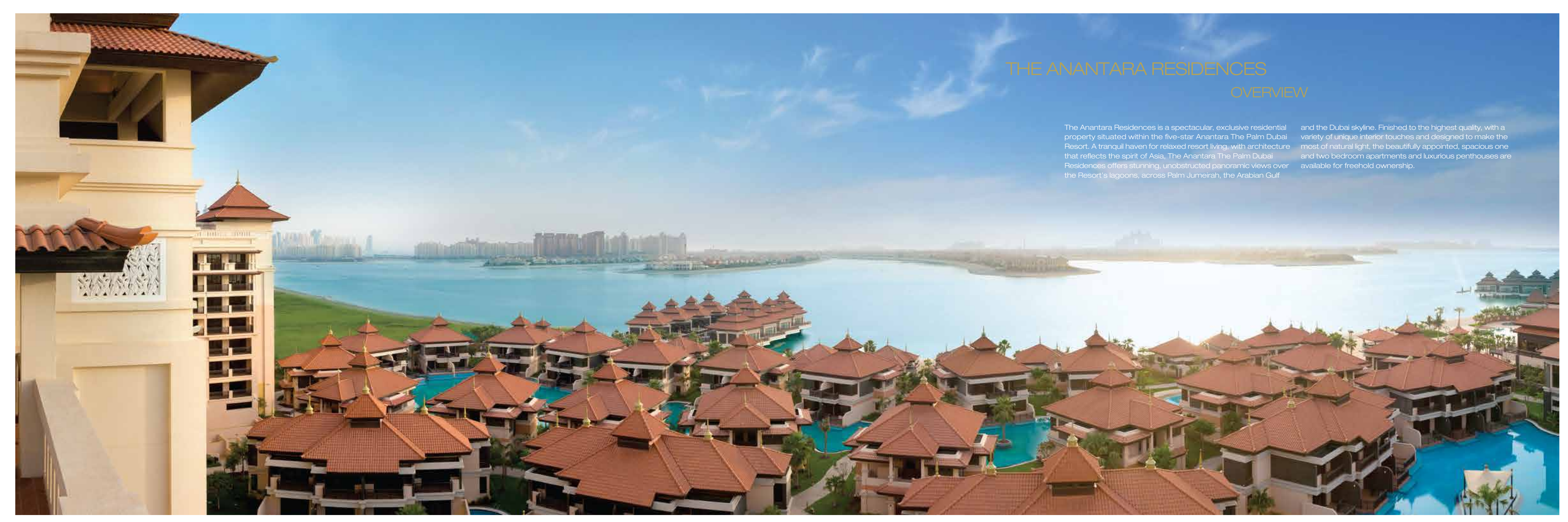
Page 06 | The Anantara Residences | The Anantara Residences Overview