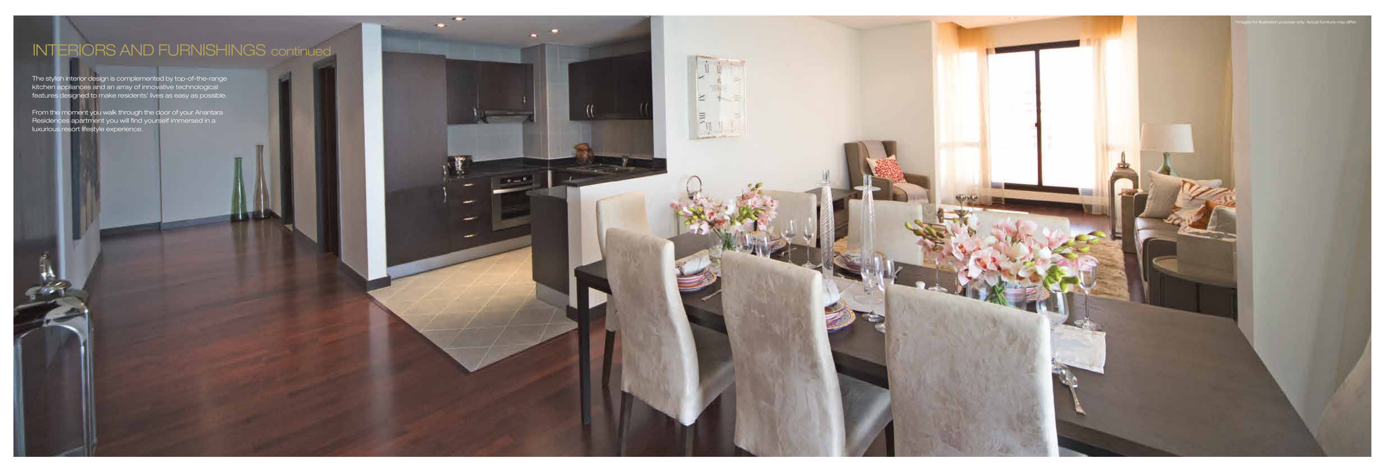
Page 14 | The Anantara Residences | Interiors and Furnishings